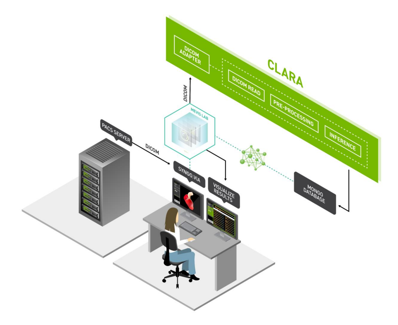
Figure 2. Clara Powered Workflow

The Ohio State University Radiology uses NVIDIA Clara to Deploy AI in a Clinical Workflow Clara SDKs are for developmental purposes only and cannot be used directly for clinical procedures