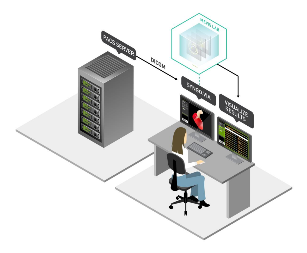
Figure 1. Clinical Workflow

The challenge for the OSU LAI<sup>2</sup> science team was to enable expert radiologists to evaluate the AI algorithm in a hospital infrastructure with minimal disruption to their existing workflow.